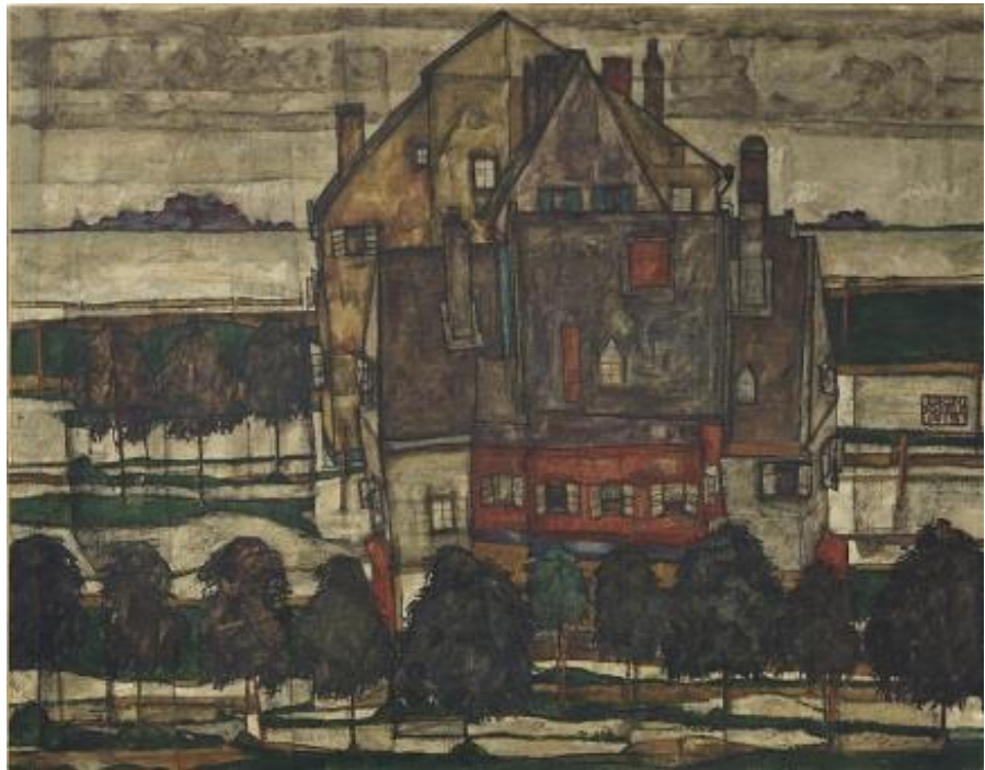
Vincent van Gogh, Moissonneur (d'après Millet) (1889, estimate: £12,500,000-16,500,000) and Egon Schiele, Einzelne Häuser (Häuser mit Bergen) (1915, estimate: £20,000,000-30,000,000)

London – Leading highlights by Egon Schiele and Vincent van Gogh are now on display at Christie's New York until 17 May 2017 ahead of London's Impressionist & Modern Art Evening Sale in June. Schiele's Einzelne Häuser (Häuser mit Bergen) (1915, estimate: £20,000,000-30,000,000) was painted in the middle of the First World War and exemplifies the artist's visionary understanding of landscape, which he used as an allegory of human emotion. Van Gogh's Le Moissonneur (d'après Millet) (1889, estimate: £12,500,000-16,500,000), was painted in 1889, the same year that he left Arles and admitted himself into an asylum. The auction will take place on 27 June 2017 as part of 20 th Century at Christie's, a series of sales that take place from 17 to 30 June 2017. The works will tour to Hong Kong from 25 to 29 May 2017 and will be on view in London from 17 to 27 June 2017.